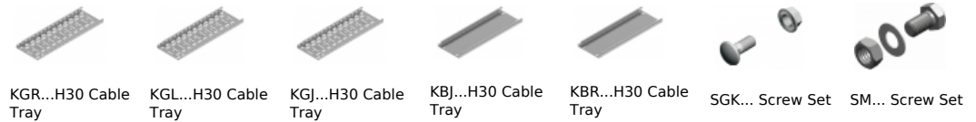
KGR...H30 Cable Tray