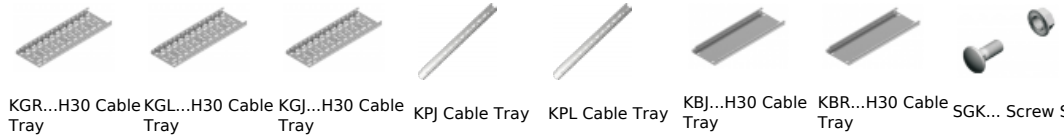
KGR...H30 Cable Tray