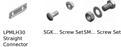
LPMLH30 Straight Connector SGK... Screw Set SM... Screw Set